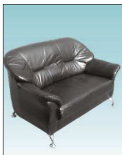
VIP Sofa Double