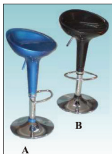
Bar Stool (Adjustable)