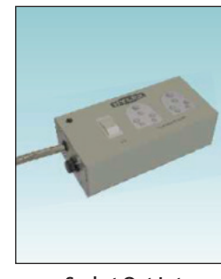
Socket Out Let