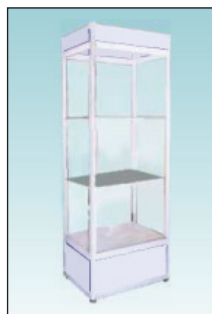
Show Case (Slim)