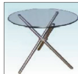
Round Table (Glass top)