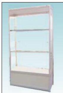
Glass Show Case