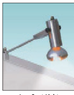
Arm Spot Light